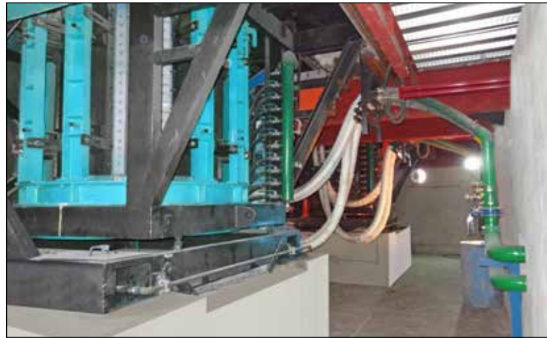
5T Induction melting furnace