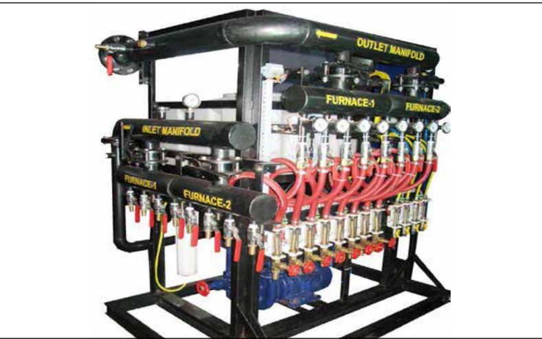
DM Water Circulation Unit