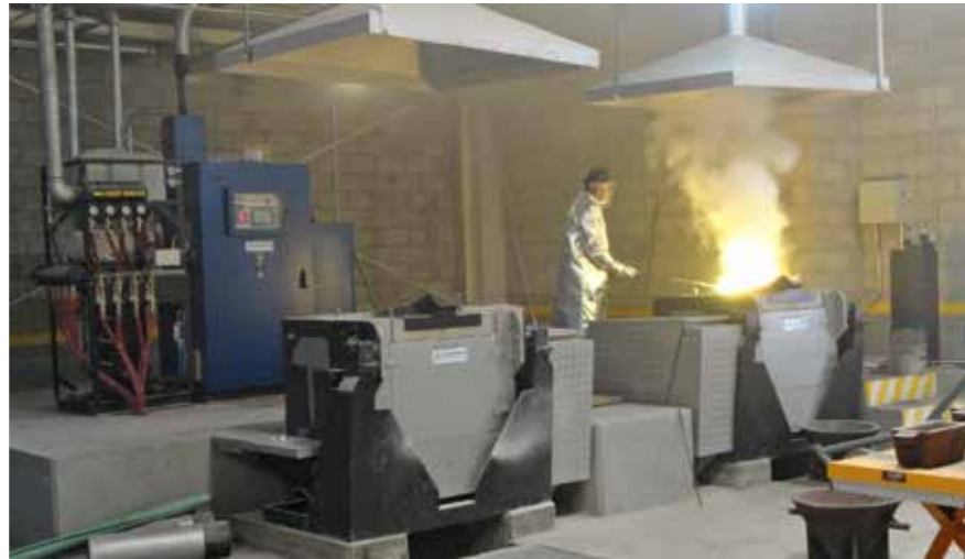
Induction melting furnace